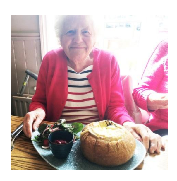
Val Hutson's whole baked camembert inside a rustic